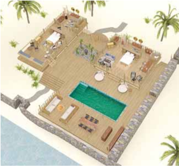
TWO-BED DELUXE POOL VILLA