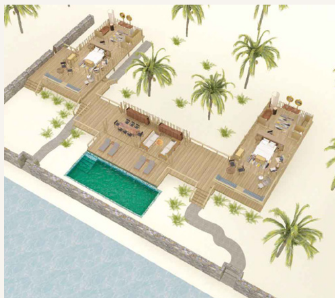
TWO-BED INFINITY POOL VILLA