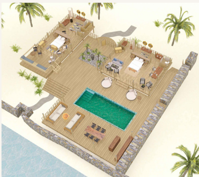
TWO-BED DELUXE POOL VILLA