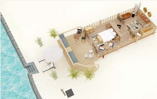
TENTED OCEANFRONT SUITE