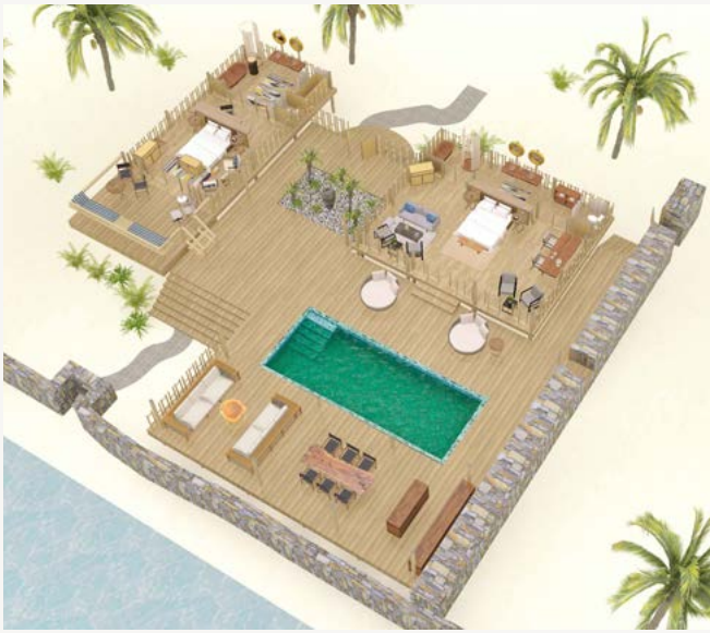
TWO-BED INFINITY POOL VILLA