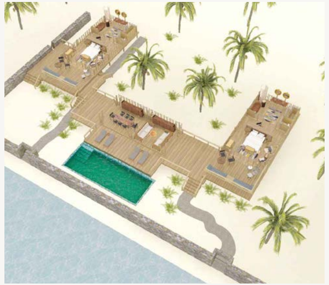
INTERCONNECTED THREE-BED DELUXE AND/OR FOUR-BED POOL VILLA