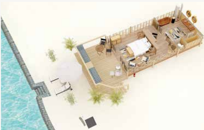
TENTED OCEANFRONT SUITE